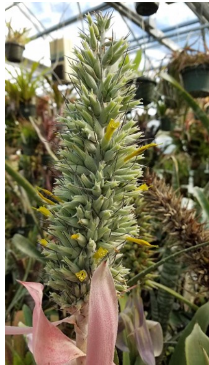
Aechmea longicuspis var. kuntzeana