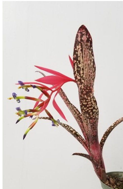
Bilbergia 'Carinao' - Lee