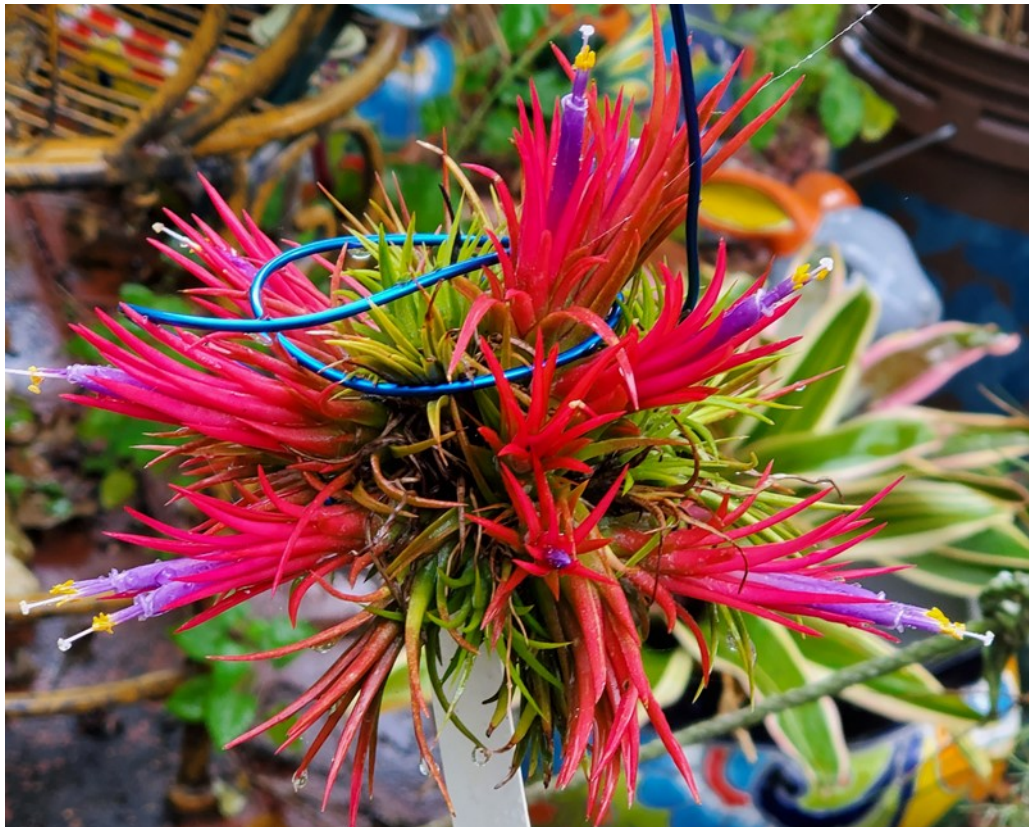
Tillandsia ionantha Fuego —Baker