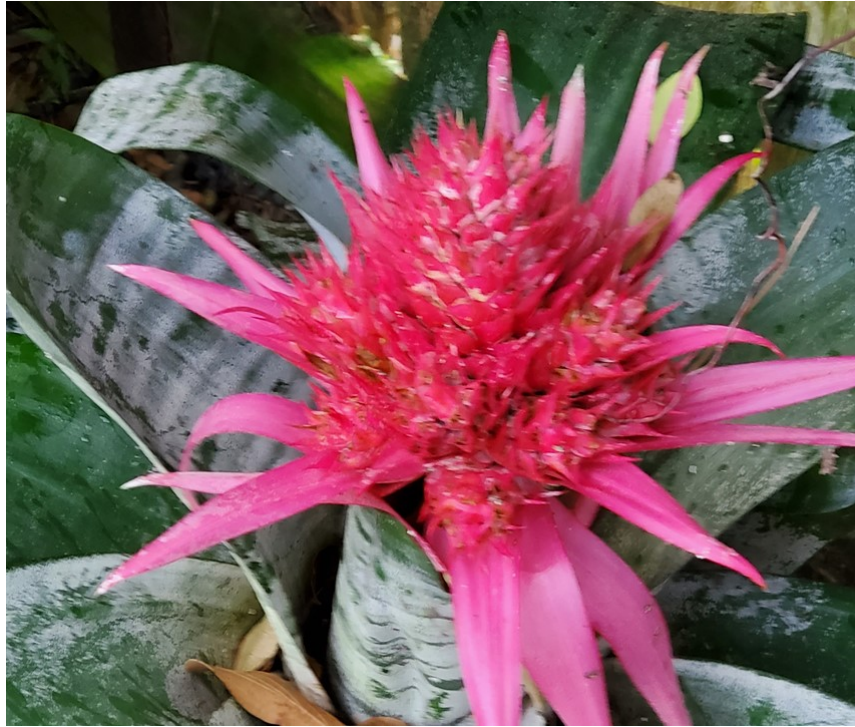
Aechmea fasciata — Baker