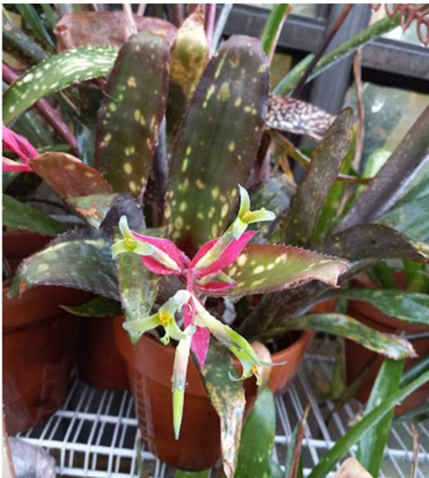
Bilbergia 'Las Manchas' - Townes