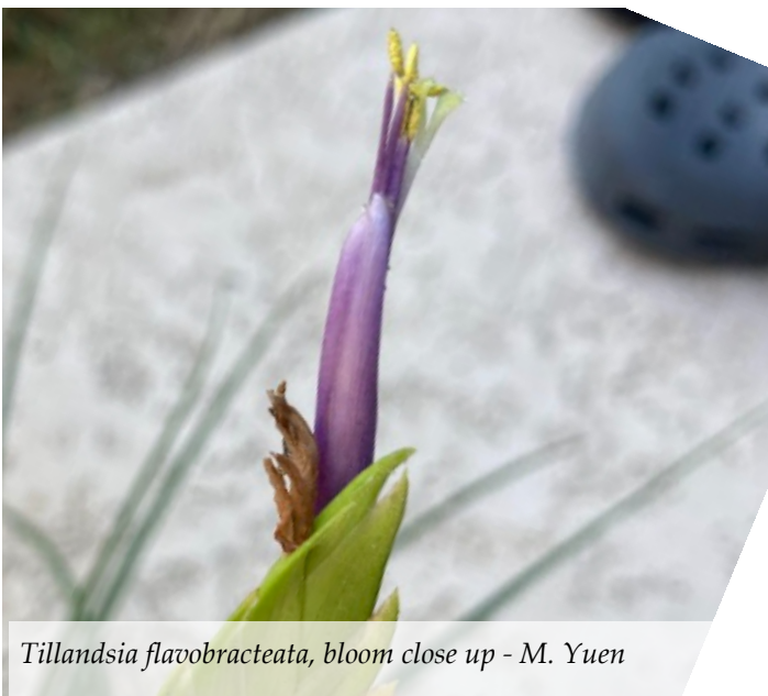
Tillandsia flavobracteata, bloom close up - M. Yuen