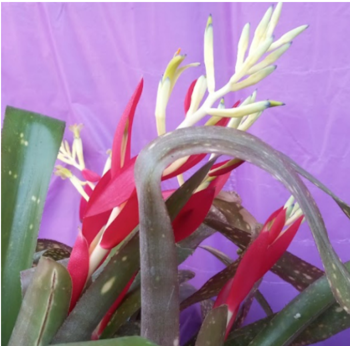
Billbergia 'Ballerina'