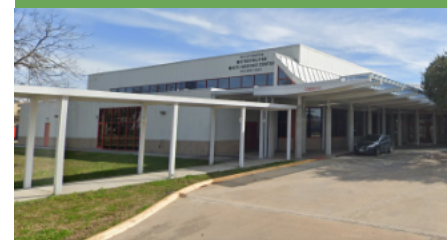
Metropolitan Multi-Service Center 1475 West Gray St., Houston, TX 77019

Please share a plant or two for Bromeliad Bingo!