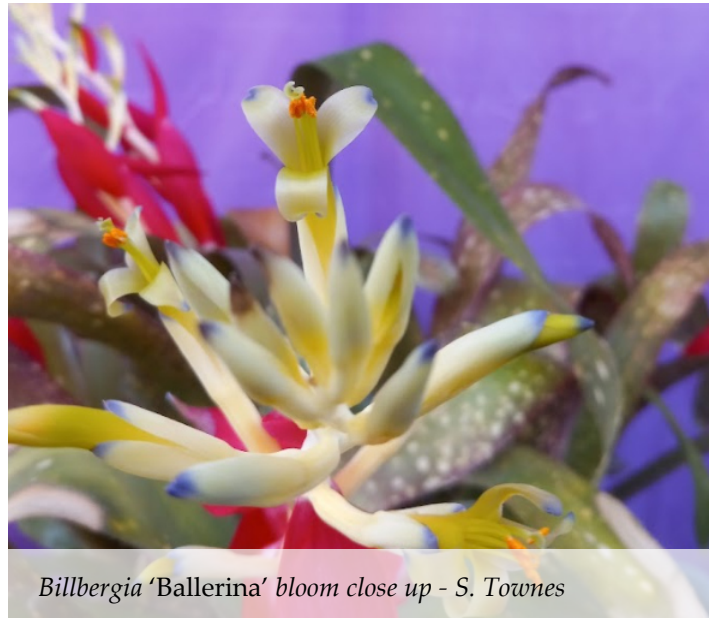
Billbergia 'Ballerina' bloom close up - S. Townes