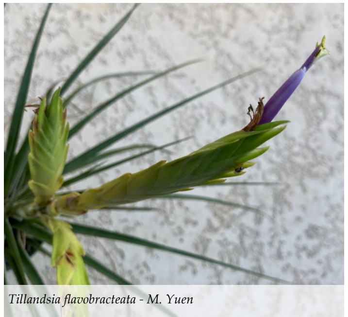
Tillandsia flavobracteata - M. Yuen

“Had this plant in transit, but was neglectful and put it in the garage during our house move...when I brought it out a few days later, this purple bloom suddenly appeared! Does darkness induce blooming?” - Mei