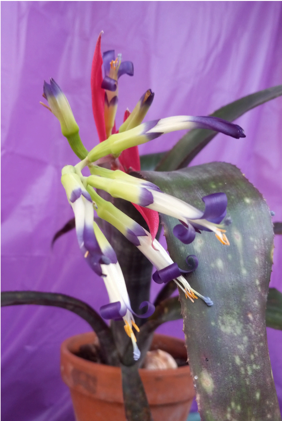
Billbergia 'Hummel's Fantasia' - S. Townes

PHOTOS COLLECTED FROM BSH MEMBERS, SEPT-OCT 2022