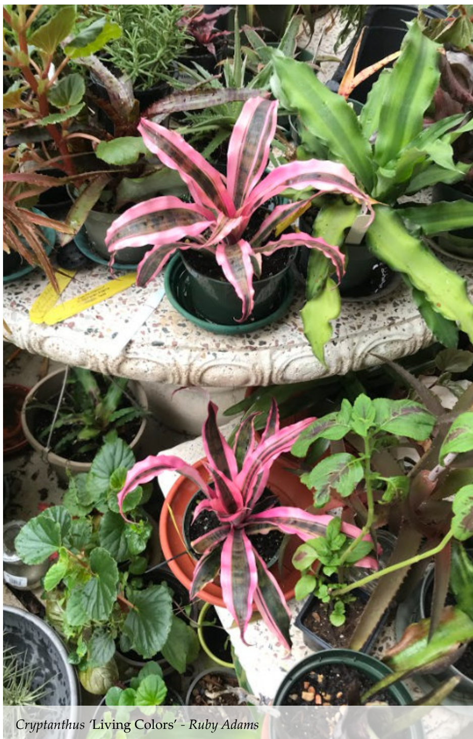
Cryptanthus 'Living Colors' - Ruby Adams

PHOTOS COLLECTED FROM BSH MEMBERS, OCT-NOV 2022