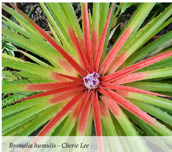
Bromelia humilis