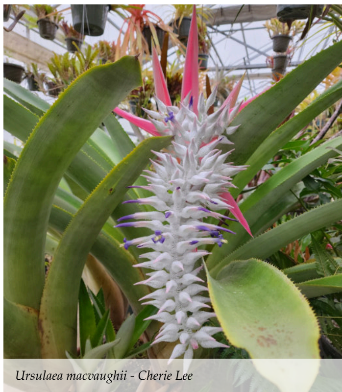
Ursulaea macvaughii