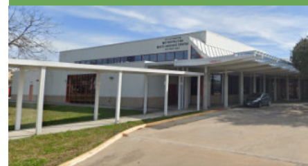
Metropolitan Multi-Service Center

Please share a plant or two for the Bromeliad RAFFLE!