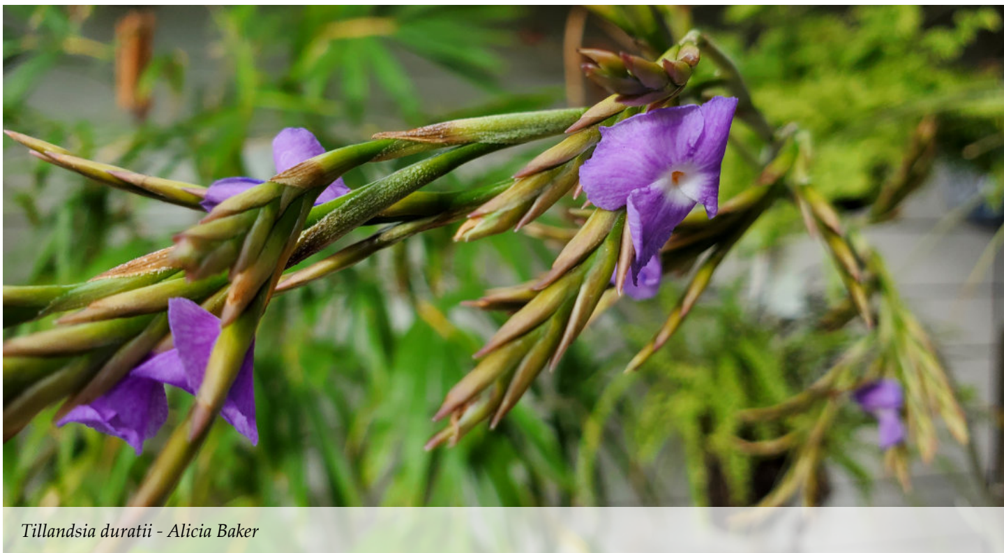
Tillandsia duratii - Alicia Baker