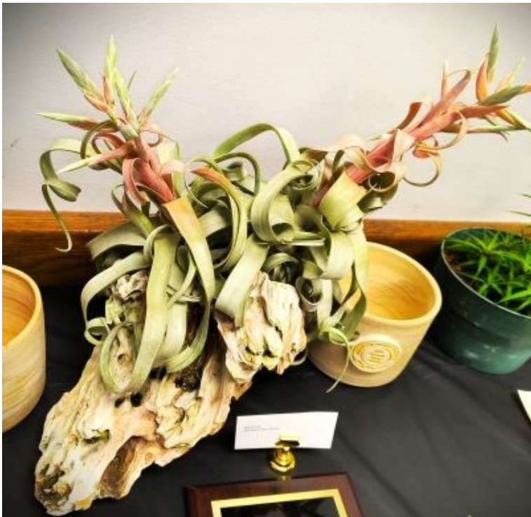
BEST OF JUDGES SECTION Tillandsia streptophylla Margo Racca