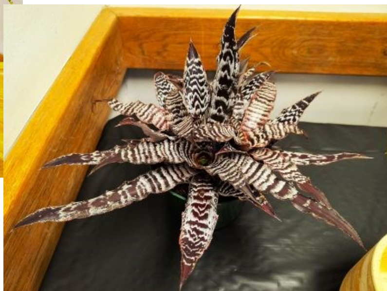
MEMBERS' CHOICE Cryptanthus 'Thriller' Cherie Lee