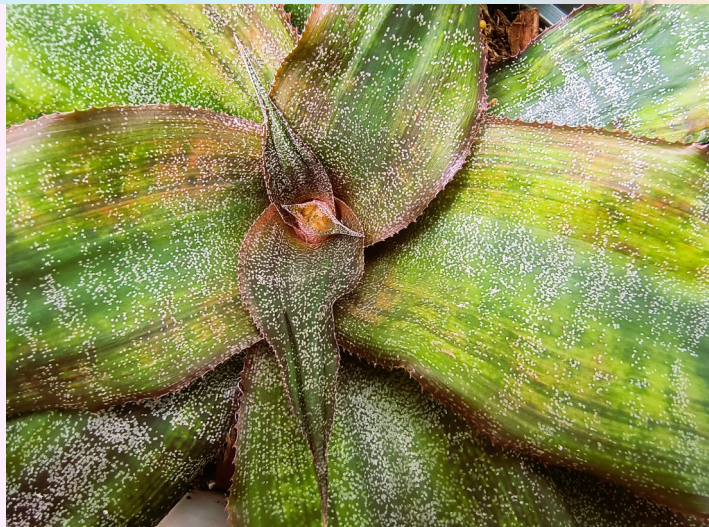
NOVEMBER Cryptanthus 'Kakadu'