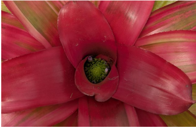
Neoregelia 'Serendipity Select'