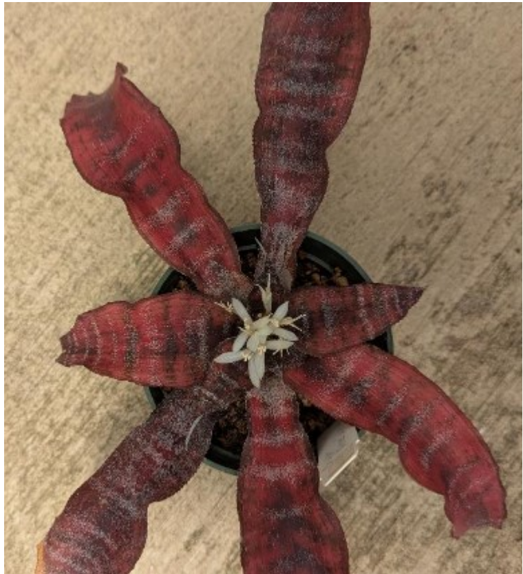
Cryptanthus 'Anne Collings'