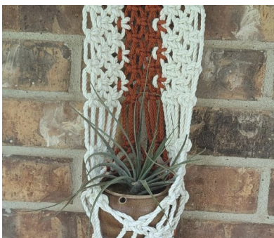
Example macrame hanger. Perfect for a TILLANDSIA

(All materials will be provided by BS/H with no cost to participants)