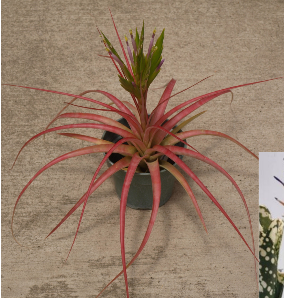
Tillandsia 'Katy Kat' Seedling from last year