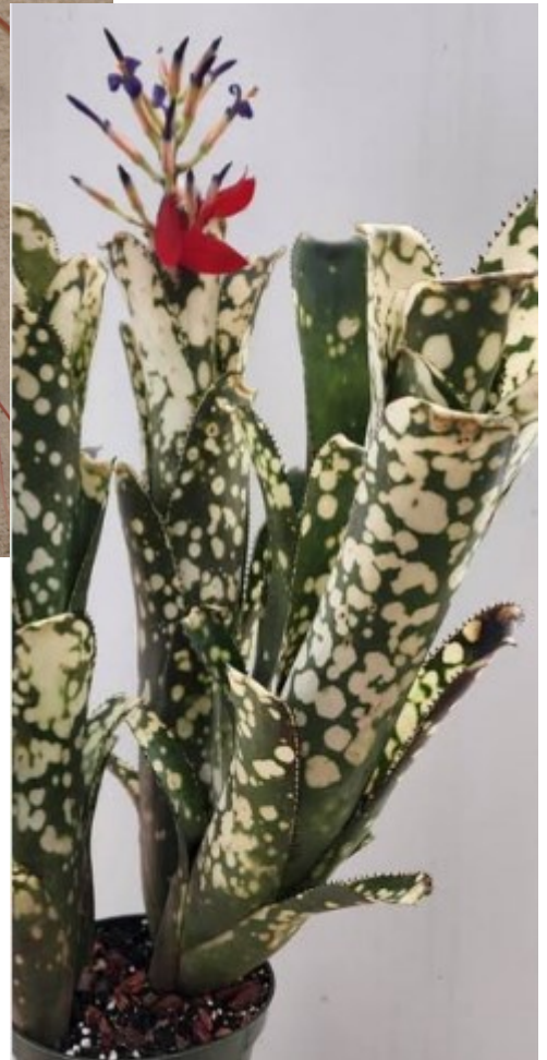
Billbergia 'Lots of Spots'