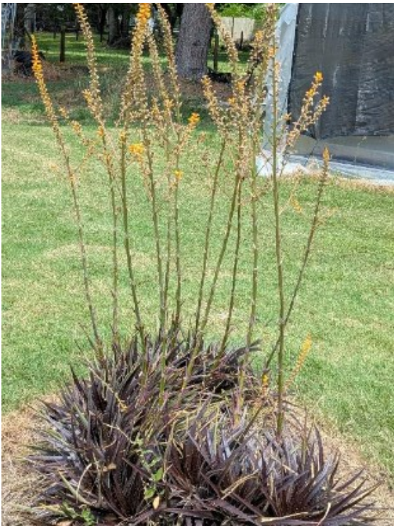
Dyckia 'Lad Cutak'