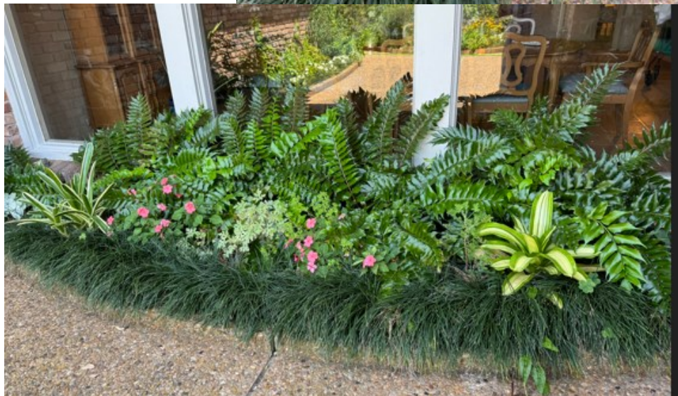
Landscaping with Broms At Elayne's (Kouzounis) home